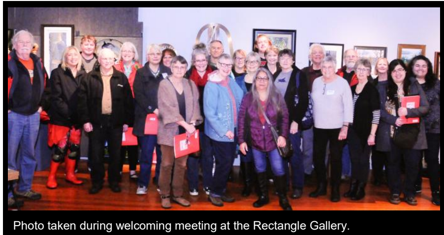
Photo taken during welcoming meeting at the Rectangle Gallery.